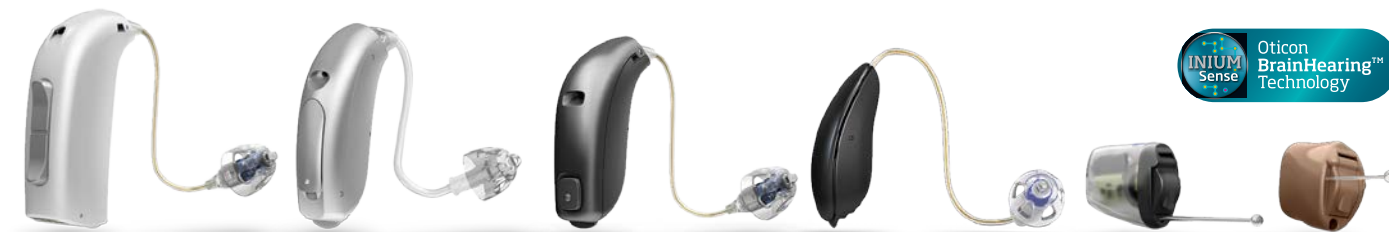
Hearing aids shown in actual size. Available in many different colours.